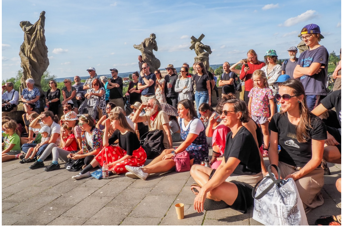
Nová síť z.s., Komunardů 885/28, 170 00 Praha 7, Česká republika