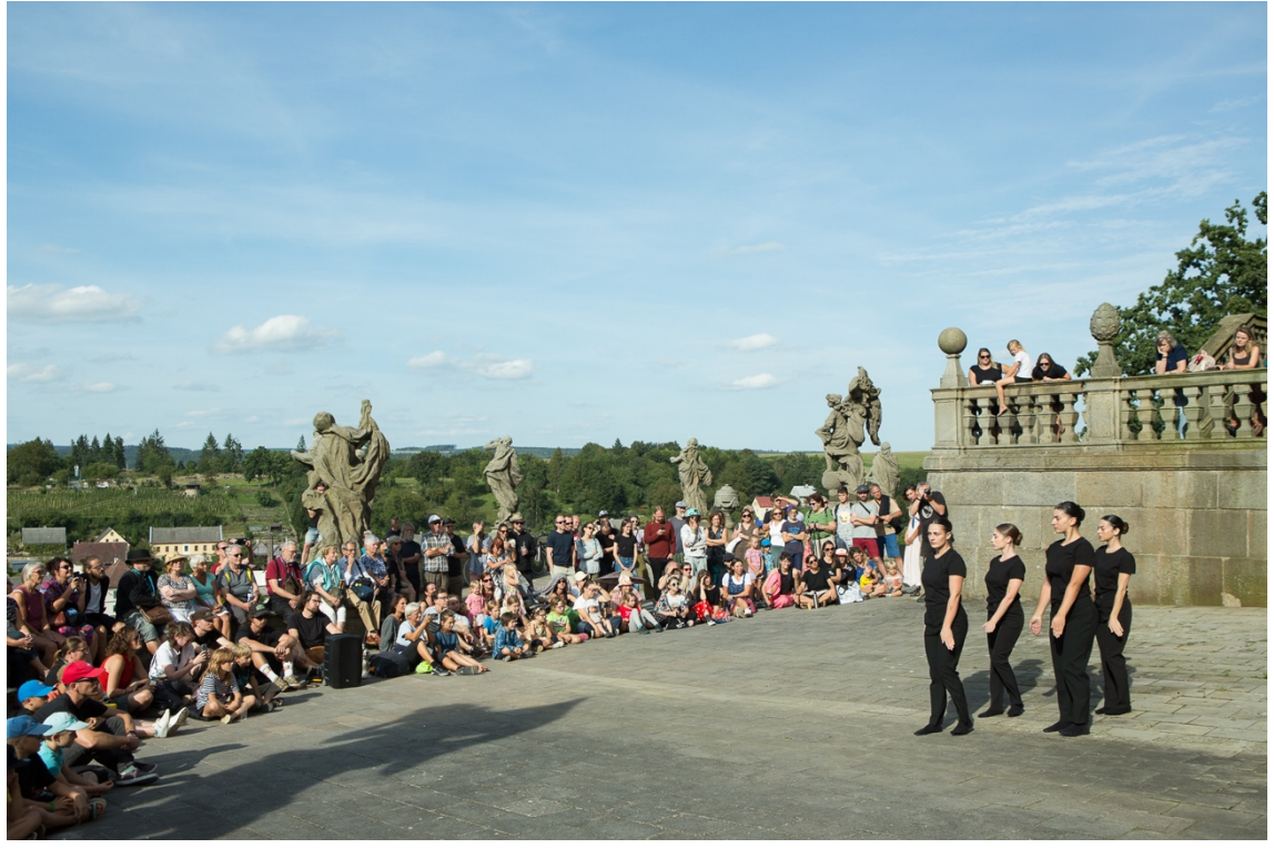
Nová síť z.s., Komunardů 885/28, 170 00 Praha 7, Česká republika