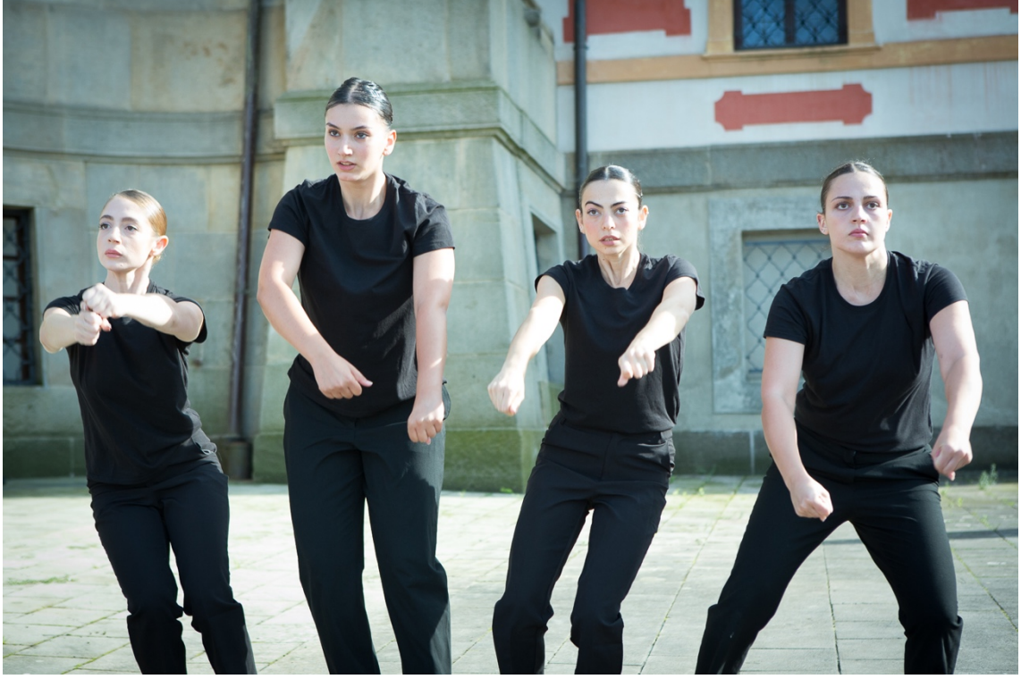
Nová síť z.s., Komunardů 885/28, 170 00 Praha 7, Česká republika