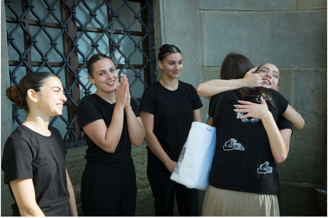
Nová síť z.s., Komunardů 885/28, 170 00 Praha 7, Česká republika